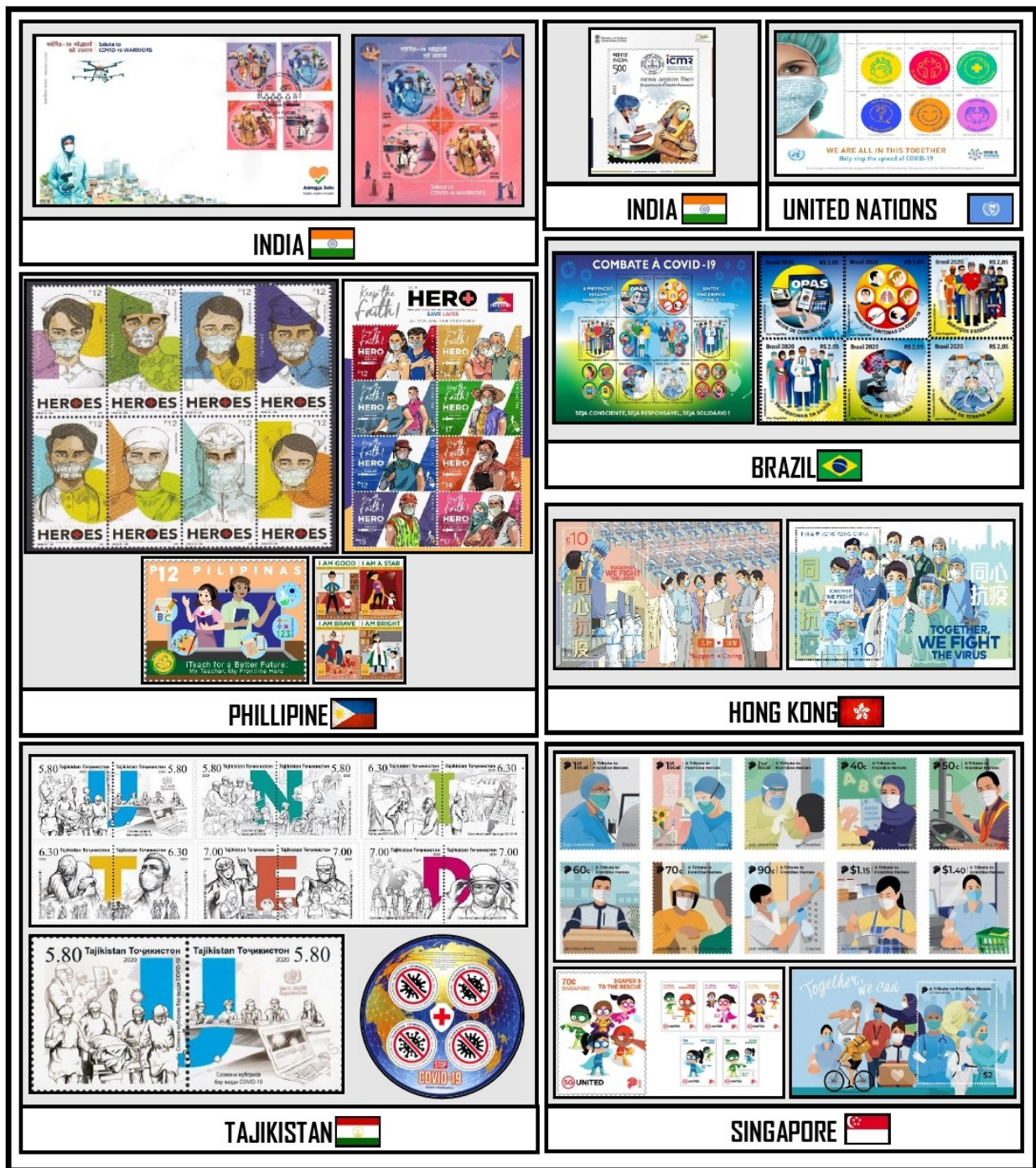
Fig.1:- Philately anthology and omnibus showing India, United Nations, Brazil, Philippines, Hongkong, Tajikistan, Singapore