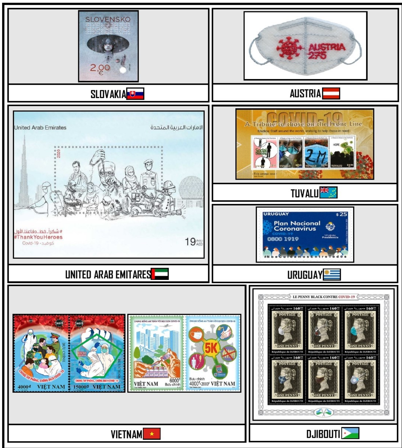
Fig.6:- Philately anthology and omnibus showing Slovakia, Austria, Tuvalu, United Arab Emirates, Uruguay, Vietnam, Djibouti