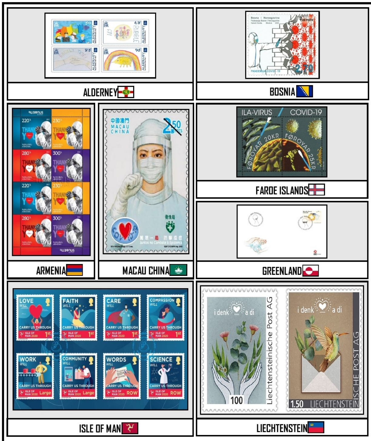
Fig.4: Philately anthology and omnibus showing Alderney, Bosnia, Armenia, Faro islands, Macau China, Greenland, Isle of Oman, Liechtenstein