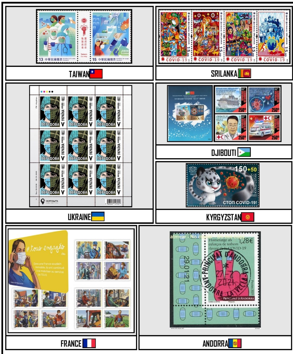
Fig.3: Philately anthology and omnibus showing Taiwan, Sri Lanka, Ukraine, Djibouti, Kirgizstan, France, Andorra