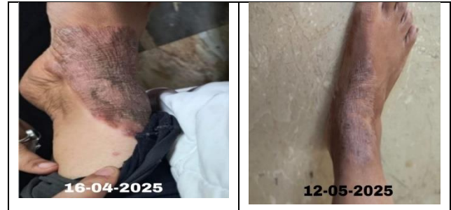
Figure-01: Images of before and after treatment